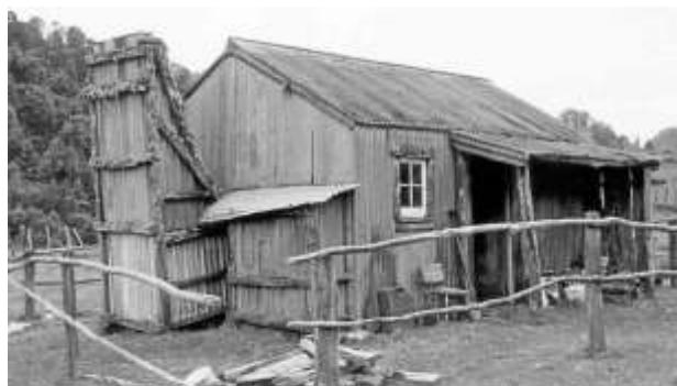
Stan's "home away from home" – a survivor of bygone days.

Cost: $145 per person (covers accommodation and transport)